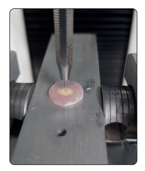
Fig. (1) Push-out test for sectioned specimen positined in universal testing machine

where \pi was the constant 3.14, r<sub>1</sub> was the radius of cervical post, r<sub>2</sub> was the radius of apical post and h was the slice thickness in millimetres.