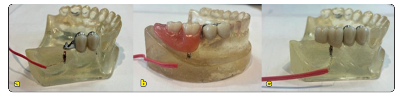
Fig. (1) (a,b,c)

The results also showed that the mean strain values were higher in group II (removable bridge) more than group I (removable partial denture) at both the baseline readings and after 2000 cycles. However, this difference was found to be statistically non-significant (table 1, fig 3).