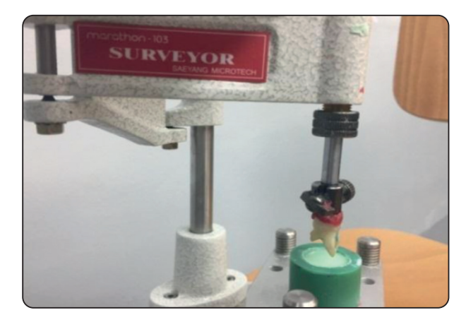
Fig. (1): Specimen fixed by sticky wax to the moving rod of the Mounting Surveyor

of dimensions 5 cm x 8 cm. Mounting teeth in their molds was done using a Mounting surveyor (Maarathon-103 Surveyor Saeyang Microtech Co.Ltd, Korea) to ensure their proper positioning, where the teeth were fixed to the pin of the surveyor with pink wax in an upright position (fig.1), then lowered into the molds centrally and vertically till the level of the resin was 2mm below the cemento-enamel junction<sup>[9]</sup>.