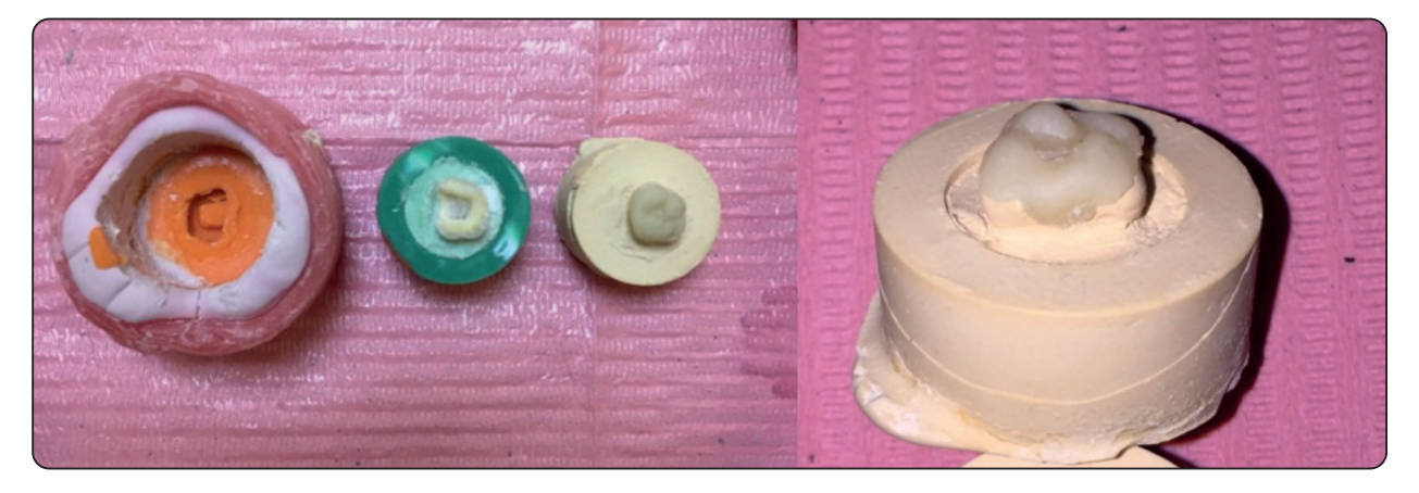
Fig. (3): Group C restorations: Rubber-base impression, prepared specimen, Final restoration on a stone model

Statistical analysis was performed using IBM SPSS Statistics Version 2.0 for Windows. Data was presented as mean and standard deviation (SD). The