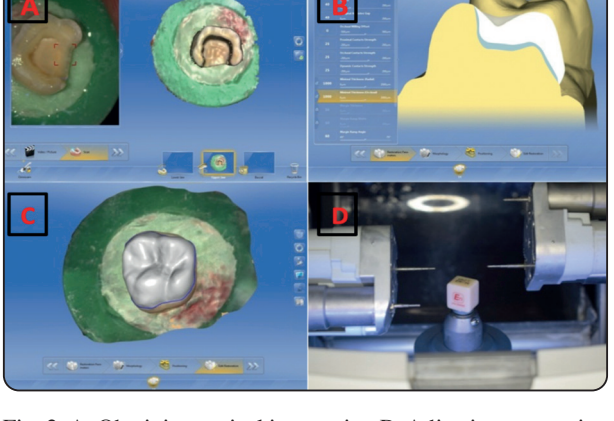
Fig. 2: A. Obtaining optical impression B. Adjusting restoration parameters C. Proposed design D. Block secured in CEREC machine ready for milling

For first two groups, the restoration was prepared using the (CEREC AC system) (Sirona Dental Systems, GmbH, Bensheim, Germany). After the type of restoration has been selected on the software, the prepared specimens were scanned by Cerec Bluecam to obtain optical impressions to produce a 3D virtual models. This was followed by inspection and verification of the virtual die where the software blocks any undesirable undercuts and hence the path of insertion of the restoration being produced is adjusted. Later, in the design phase, the proposed design of the endocrown was displayed on the model and any final adjustments were made. After the suitable grinding instruments were secured, the milling order was activated, and the selected block placed in the milling chamber of the MC XL unit was ground. The milling process was later fol-