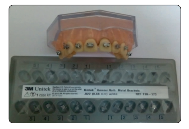
Fig. (1): Metal brackets bonded to typodont

The testing model was positioned vertically on the lower fixed member of the universal testing machine. For the movement of canine, a loop of arch wire was made and loop was engaged in the hook of canine bracket. Free end of SS wire was held by upper cross head of testing machine (instron model 2519-107). The upper cross head member of the testing machine was adjusted to move upwards at a constant speed of 0.5 mm/min.<sup>5</sup> Movement was started when canine was in contact with the distal surface of lateral incisor and stopped when canine just touched the mesial surface of second premolar. Total distance bracket travelled was 7 mm as recorded on computer. (Figure 3)