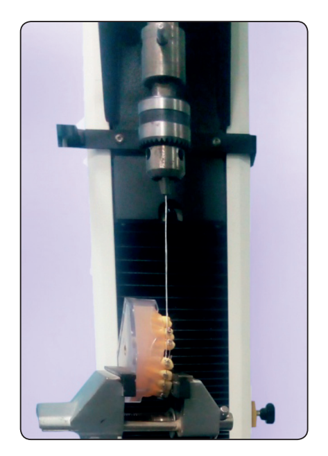
Fig. (3): Typodont mounted on instron testing machine