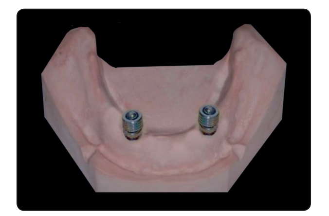
Fig. (1): The study model with the ball abutments and metal housings.

The overdentures in each group were subjected to cyclic fatigue loading using a T-shaped bar applied to the second molar area while the dentures were fixed in place anteriorly at three points namely: the midline, and at each metal housing of the abutments, on an acrylic duplicate of the study model that was relieved starting from the area distal to the ball abutments and covered with a soft silicone layer to mimic the cushioning effect of the mucosa overlying the edentulous ridge. The fatigue loading was conducted using a chewing simulator (CS-4.8, SD Mechatronik, Feldkirchen-Westerham, Germany) at 80 N at 1 Hz for 300,000 cycles. Then, as seen in figure 5, the soft silicone was removed from the acrylic cast and fracture loading of each group was conducted using a universal testing machine (Lloyd LRX, Lloyd Instruments) applying a stainless-steel ball 1 cm in diameter to the free end of each denture bilaterally at a cross head speed of 1 mm/min until fracture occurred. Finally, the statistical analysis of the fracture values was statistically analyzed using the one-way ANOVA (SPSS version 20 for windows) at a significance level of p<.05.