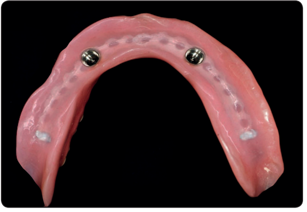
Fig. (2): Group I chrome-cobalt reinforced overdenture