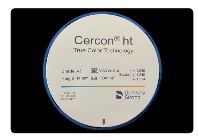
Fig. (3): The zirconium CAD/CAM disk.