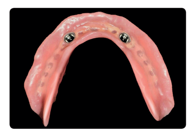
Fig. (4): Group II zirconium reinforced overdenture