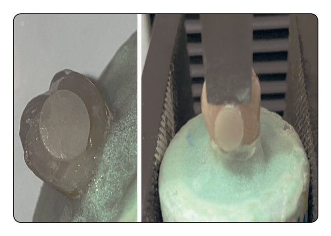
Fig. (1) Cemented ceramic disc on tooth surface before and during measurement.

chisel-shaped blade with a 0.6 mm thick edge was used to apply the shearing force in a compressive mode of load. The specimens were loaded at a cross-head speed of 0.5 mm/min with a 5000 Newton load cell until the bond ruptured and the shear force was calculated. Newtons were used to compute the force. Converting Newtons to Megapascals was used to calculate shear bond strength (MPa)