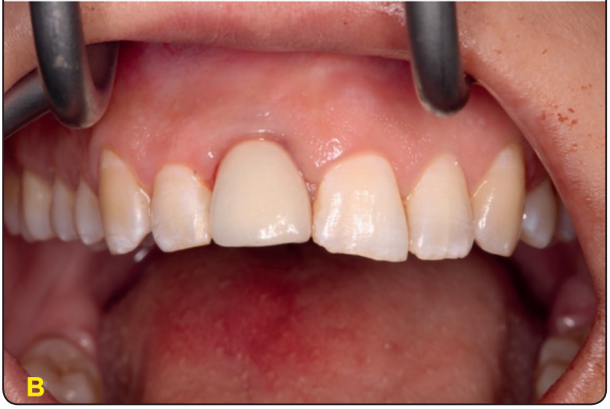
Fig. (2): (a) Pink esthetic score immediate post-operatively and (b) at 6 months post-operatively