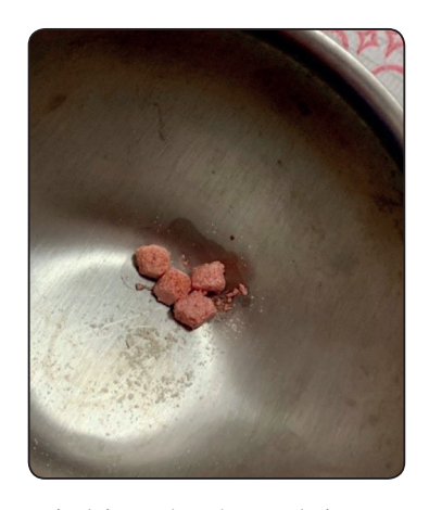
Fig. (3) Beta-tricalcium phosphate gelatin sponge socked in CGF

The surgery was performed under local anesthesia of 2% lignocaine containing 1:100,000 of adrenaline concentration. Sulcular incision mucoperiosteal flap was reflected and complete debridement of the defect by scaling and root planing was accomplished. The defects were packed with biodegradable gelatin/β-TCP sponges incorporating CGF [Fig 4. a&b]. The flaps were then sutured with an interrupted suture technique using 3 zero silk