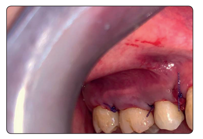
Fig. (5): Flap closure with interrupted suture.

The intergroup comparison demonstrated a statistically significant difference between the groups being studied for all clinical parameters at all the evaluation periods (P>0.05) in favor to group II except for CAL, whereas there was no statistically significant difference between the two groups at 6 months. (table 2)