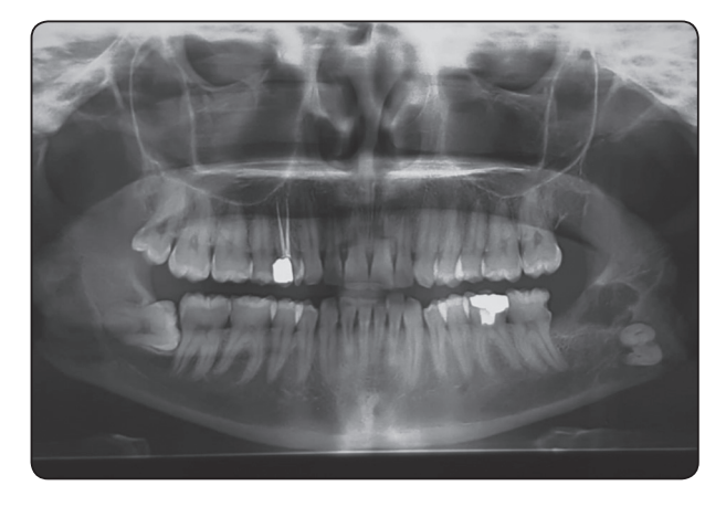
Fig. (4): OPG showing displaced third molar