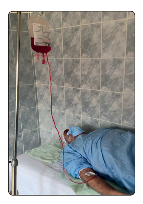
Fig. (3): Ozonizated blood reinfusion.