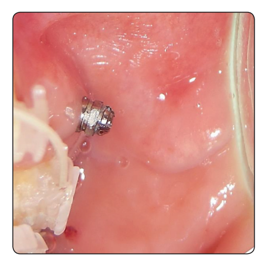
Fig. (3) Inflammation opposite to MSI in Left cheek

Oral hygiene index score gradually increased at one week, one month, 3 months and four months after MSIs insertion (table 2). ANOVA test revealed that the difference in Oral hygiene index score was statistically significant (p=0.05).