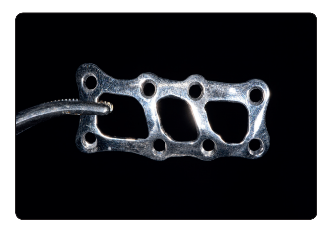
Fig. (2): A Photograph showing the final 3D printed PSP before placement.

Full laboratory investigations and medical consultation were requested to reveal patients' fitness to undergo surgery under general anesthesia. Patients were scrubbed and draped in a standard surgical fashion, the fracture was approached