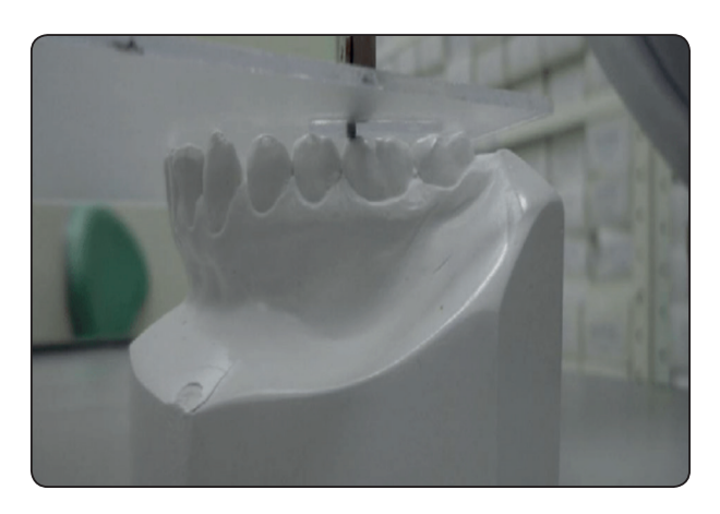
Fig. (3) Measurement of the curve of Spee on study model