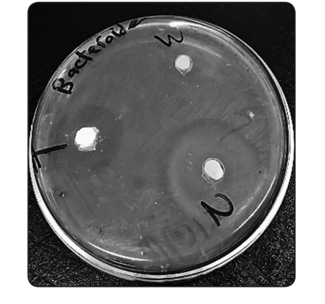
Fig. (1): Antimicrobial susceptibility testing for the three obturating materials by agar diffusion method against B. fragilis. Obturating materials numbering were; (1) ZOE; (2) Endoflas, and (3) Metapex.

Again, ZOE showed a statistically significant difference with each of Endoflas (p<0.001) and