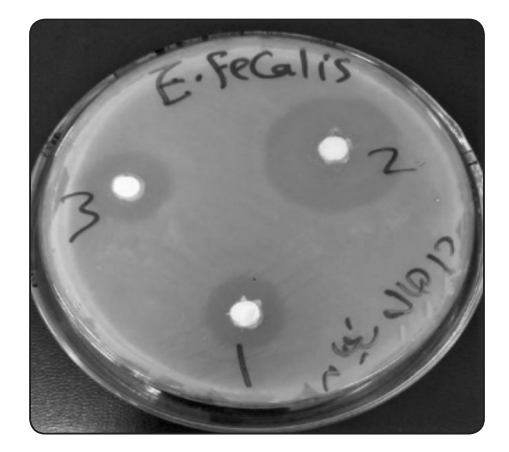
Fig. (2): Antimicrobial susceptibility testing for the three obturating materials by agar diffusion method against E. faecalis. Obturating materials numbering were; (1) ZOE; (2) Endoflas, and (3) Metapex.

Endoflas showed the highest mean value of inhibition zone followed by (Metapex), while the least mean value of inhibition zone was found in ZOE (figures 2 and 3). There was a statistically significant difference between ZOE, Endoflas and Metapex (p<0.001).