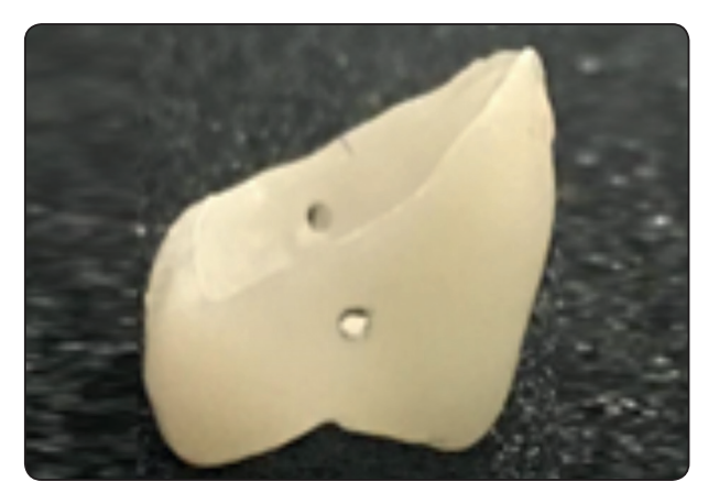
Fig. (5): Perforations in the cervical areas of the teeth for retention of the crowns within the denture base.