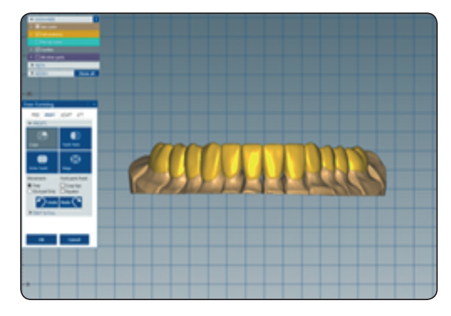
Fig. (2): A scan of the porcelain teeth.

An impression was made of the denture with porcelain teeth, using silicone rubber base impression material. The impression was poured in hard stone. After ditching the stone cast, the teeth were reduced to simulate teeth preparation form for crowns using a tapered with round end stone 0.5 mm in diameter guided by a dental surveyor* with a straight handpiece. Fig(3)