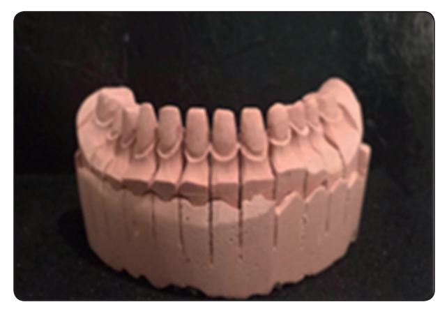
Fig. (3): Prepared abutments with 0.5 mm finish line.

An impression was made of the denture with porcelain teeth, using silicone rubber base impression material. The impression was poured in hard stone. After ditching the stone cast, the teeth were reduced to simulate teeth preparation form for crowns using a tapered with round end stone 0.5 mm in diameter guided by a dental surveyor* with a straight handpiece. Fig(3)