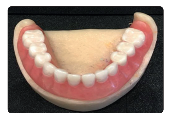
Fig. (6): Mandibular complete denture with monolithic zirconia teeth.

occlusal index fabricated on the complete denture with porcelain teeth. After flasking the denture and wax elimination, the zirconia teeth were filled with tooth-colored cold cured acrylic resin till the gingival margin of the teeth. The flask was closed and left until complete polymerization. Heat polymerizing acrylic resin was then mixed, and packed into the flask, and processed in the usual manner, then finished and polished followed by packing heat-polymerizing acrylic resin material for denture base, after processing the denture was finished and polished. Fig(6)