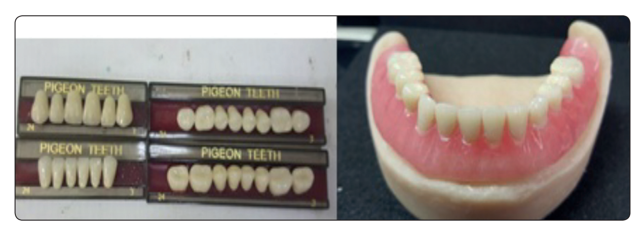
Fig. (1): Complete denture with porcelain denture teeth.

For group II; the finished complete over dentures with porcelain teeth was scanned by CAD/ CAM system** extraoral scanner to record the full contours and occlusal anatomy of the porcelain teeth. Fig. (2)