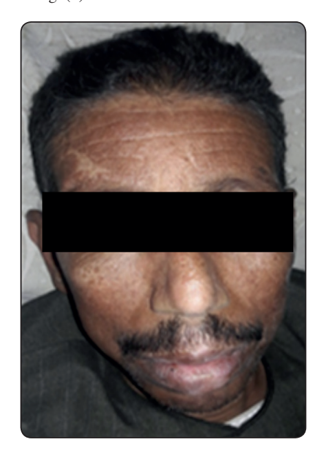
Fig. (4) Skin hyperpigmentation.