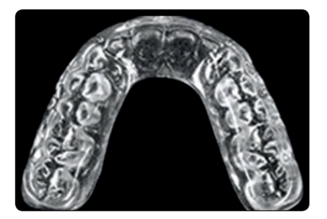
Fig. (1) Hard acrylic splint