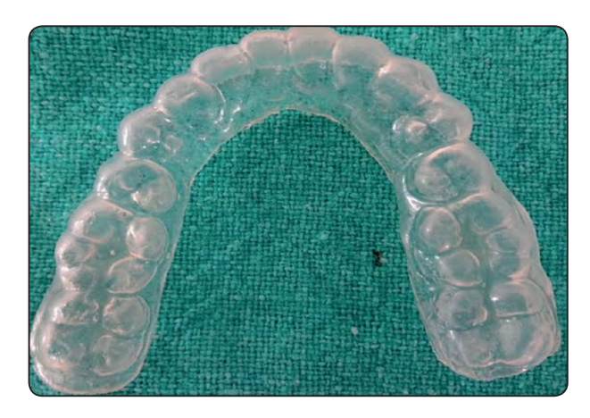
Fig. (2) Soft splint