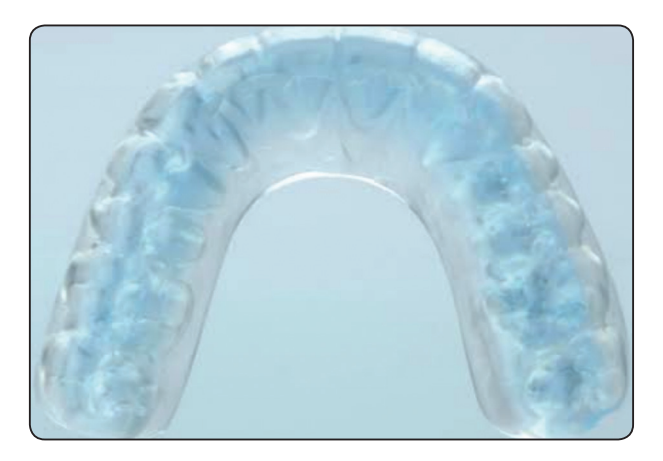
Fig. (3) Dual laminated splint