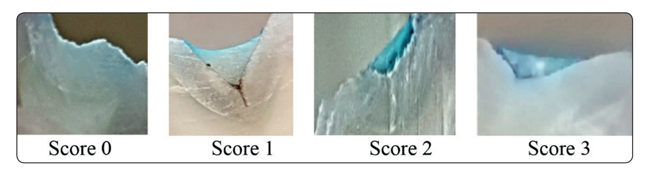
Fig. (1) Dye penetration scores: 0= no evidence of dye penetration; 1= dye penetration of less than 1/3 from the margin of restoration; 2= dye penetration of more than 1/3 and less than 2/3 from the margin of restoration; 3= dye penetration of more than 2/3 from the margin of restoration.

An observation that was found in the present