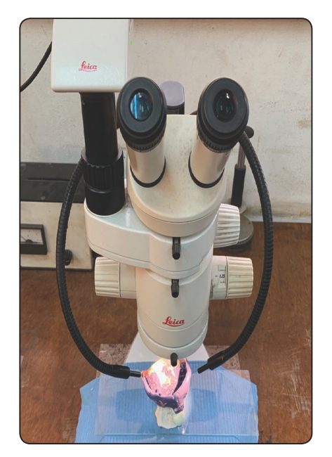
Fig. (7) Polyether impression analysis under the stereomicros cope and photographing with an attached camera of x60 magnification power.