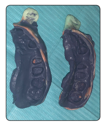
Fig. (6) Pre-retraction and post-retraction polyether impressions.