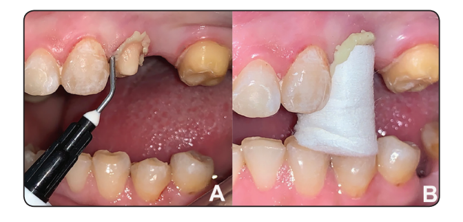
Fig. (4) Traxodent retraction system application; A) Traxodent retraction material injected into the gingival sulcus. B) Comprecap placed with biting force to push Traxodent into the sulcus.

Figure 5A, followed by syringing copious amounts of NoCord wash material into the gingival sulcus and around the preparation and adjacent teeth as seen in Figure 5B. The material was left to set for 4:45 min., then was removed from the mouth as seen in Figure 5C.