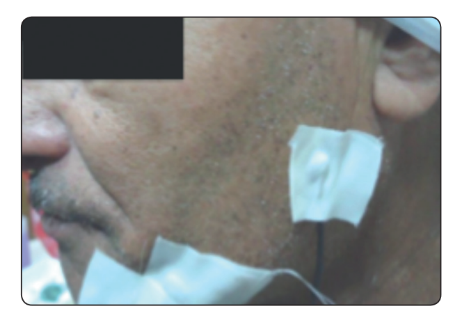
Fig. (4) Recording RMS values of the EMG records of the masseter muscle.