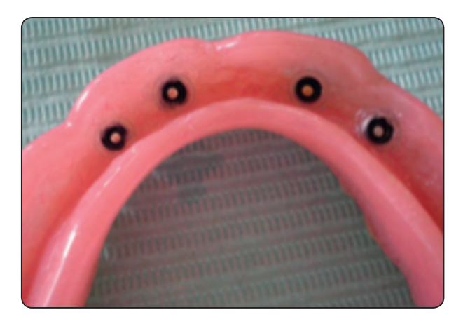
Fig. (3) The polycarbonate housing containing the rubber O rings picked up in the mandibular ovedenture.