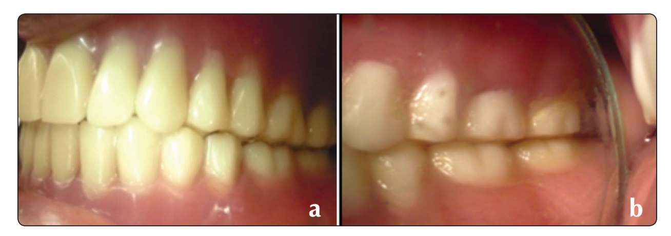
Fig. (1) Upper and lower complete dentures constructed following (a) the LO scheme in group I patients and (b) the MO scheme in group II patients.

The maxillary posterior teeth were modified to eliminate buccal cusp contacts in centric relation and positioned with slight rotation to allow only the palatal cusps to occlude with the opposing widened central fossae of the mandibular posterior teeth that were modified to show reduced buccal and lingual inclines.