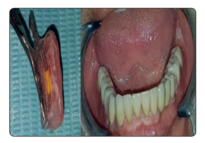
Fig (5) Final fitting of the skeleton RPD in the patient's mouth

Statistical analysis performed with SPSS 20<sup>®</sup>, Graph Pad Prism<sup>®</sup> and Microsoft Excel 2016 with a