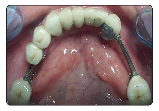
Fig (4) Final cementation of the crown-bar assembly in the patient's mouth