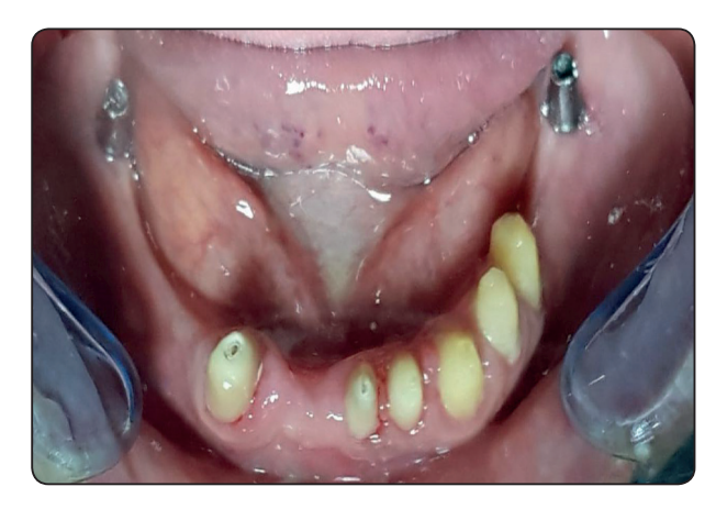
Fig (3) Implant abutments prepared to receive PFM crowns