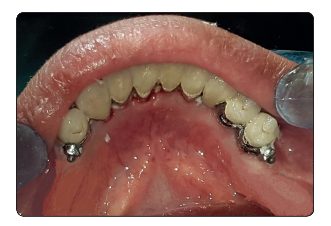
Fig (2) PFM crowns with an extracoronal OT attachment

Porcelain was built-up on the metal crowns, fired, finished, glazed and placed in the patient's mouth followed by an overall rubber base impression;