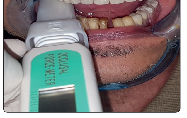
Fig (1) Patient biting on the occlusal force meter

The biting force was measured for each patient at the time of denture insertion and 4 month later.