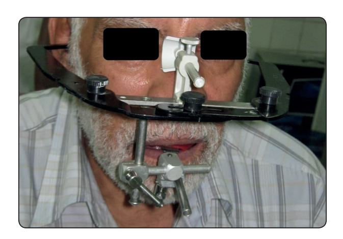
Fig. (1) Face bow record