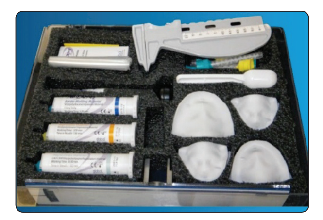
Fig. (1) The AvaDent digital system.

Digital dentures were constructed using the AvaDent digital system (AvaDent TM Digital Dentures, Scottsdale, AZ, USA) with materials and techniques provided by the manufacturer. The AvaDent denture can be completed in 2 appointments, the measurements and records were recorded at the first appointment and the dentures inserted at the second appointment. Briefly, in the first appointment maxillary and mandibular impressions were made using provided thermoplastic trays and AvaDent heavy body and light body polyvinylsiloxane border molding and impression materials, respectively. (Fig. 1)