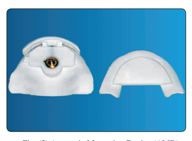
Fig. (2) Anatomic Measuring Device (AMD).

relined with fast set polyvinylsiloxane impression material, following the determination of the vertical dimension of occlusion (VDO), the relined AMD trays are placed in the patient's mouth, and the patient is requested to close until the adjustable pin touches the tracing table. A screw driver is then used to move the central bearing pin up or down until the appropriate VDO is obtained. A Gothic arch tracing is then recorded by having the patient make protrusive and lateral mandibular movements. The apex of the Gothic arch tracing resembles an arrow and represents centric relation. A round acrylic resin bur is used to create a small depression at the apex of the arrow, the mandible is then guided until the pin fits in the created depression, and an interocclusal registration material is injected between the maxillary and mandibular AMD trays to secure them together. Flange and tooth mould templates were also used to determine lip support, midline of the lip, the horizontal lip line, and the appropriate tooth size and shape. The completed impressions and the final AMD were sent to the laboratory for fabrication of the dentures. Following the scanning of the AMD and the definitive impressions, a virtually designed complete denture was sent back for evaluation and approval of the design prior to milling of the final dentures. Following the milling of the complete denture, insertion procedures are the same as those used for any conventional complete denture.