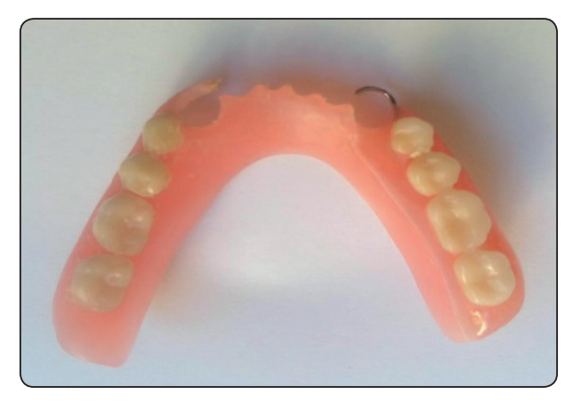
Fig (2) Finished acrylic removable partial denture with wrought wire clasp at the right side and polyamide clasp at the left side.

junction of the abutment. Reference contact points(d & b) were the highest points of the mesial and distal interdental alveolar bone of the abutment respectively. The change in the length of (cd) and (ab) perpendicular lines were measured to estimate the bone level change measially and distally; while (a & c) points located on (B and C) lines. (fig.3)