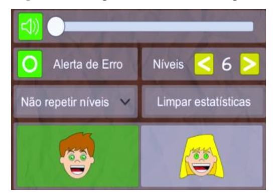
Fig. 2 – Configurationmenu of thegame