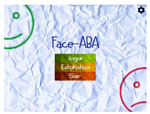
Fig. 1 – InitialscreenFace-ABA

The Face-ABA presents itself as a game with the purpose to assist professionals from Education and Psychology in the teaching of interpretation and recognition of facial expressions for children with autism spectrum, the Fig. 01 the initial screen of the game and the Fig. 02 shows the configuration menu of the game.