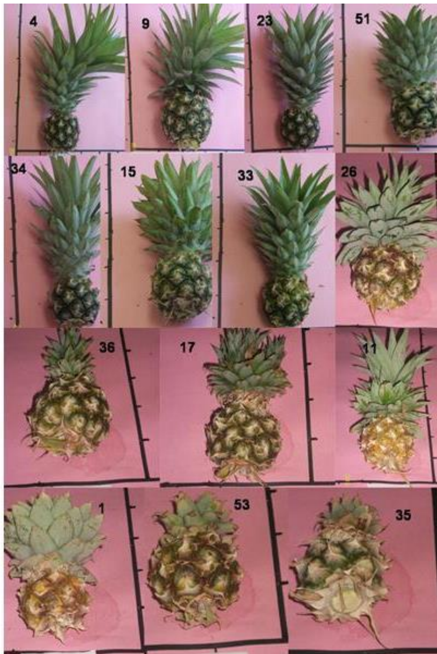
Fig. 2a. Fruit, flowers and crown morphological characteristics for various strains resulted from colchicine treatments.