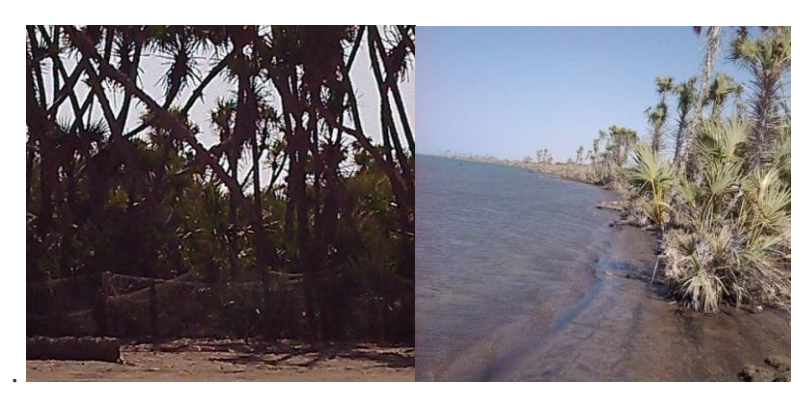
Fig. 2. The coast of the Ghulifqh Bay.

On the coast of the Bay, the village of Al-Mabrouk is found, about 1 km from the coast from the end of the Bay, with a population no more than 300 people. Another village, with the name of Madian, has only 7 houses, with a population of about 30 people. In both villages, most of the people are working in fishing, agriculture and grazing. There are also some wild plant made-up nests established on the coast, used as rest sites for fishermen, preservation of fish and fishing equipments as well (Fig. 3). The fishing methods used are gill nets and small traps (Sakhwa) (Fig. 4) and large traps (petah), with small boats made of wood or fiberglass used in fishing operations in areas near the coast.