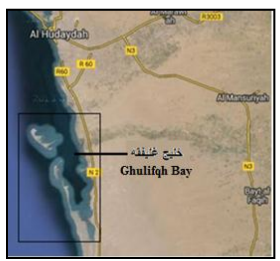
Fig. 1. Map showing the location of the Ghulifqh Bay in relation to Hudaydah city.