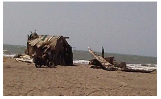
Fig. 3. Fishermen's nest.

On the coast of the Bay, the village of Al-Mabrouk is found, about 1 km from the coast from the end of the Bay, with a population no more than 300 people. Another village, with the name of Madian, has only 7 houses, with a population of about 30 people. In both villages, most of the people are working in fishing, agriculture and grazing. There are also some wild plant made-up nests established on the coast, used as rest sites for fishermen, preservation of fish and fishing equipments as well (Fig. 3). The fishing methods used are gill nets and small traps (Sakhwa) (Fig. 4) and large traps (petah), with small boats made of wood or fiberglass used in fishing operations in areas near the coast.