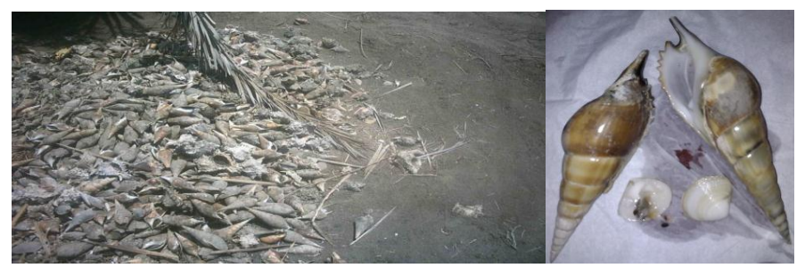
Fig. 6. Some types of gastropods in Ghulifqh region

In addition, cephalopod species (squid, sepia and octopus) and Cerithidae cingulato , Balanus amphitrite , coexist with several groups of other invertebrates such as Sponge, Coeleoterates, Echinoderms, and their presence was less than the rest of the species. There are also different types of snails (Mollusca) in Ghulifaqh Bay (Fig. 6), such as: Nerita undata, Planaxis suliatus, Terebralia palustis, Conus tessolatus and Nerita polita .