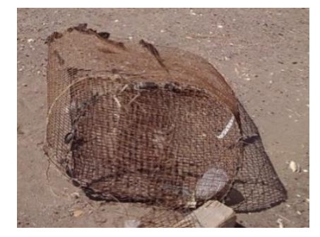
Fig. 4. A small trap (al-sukhwa).