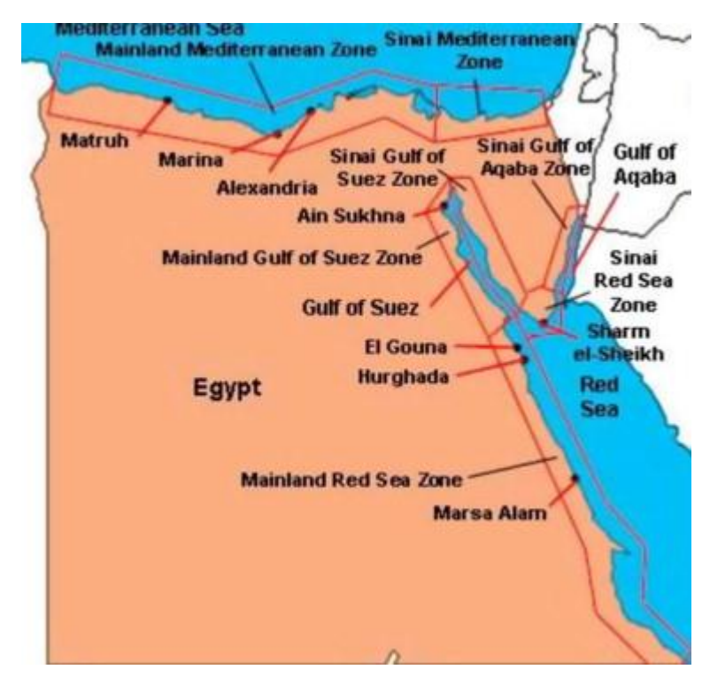
Figure (2): Egypt costal zones (AbdeL-Latif et al., 2012)

which 800 km of fringing reef stretches from Hurghada to the Egyptian-Sudanese borders only at the east. (El-Asmar et al. , 2015).