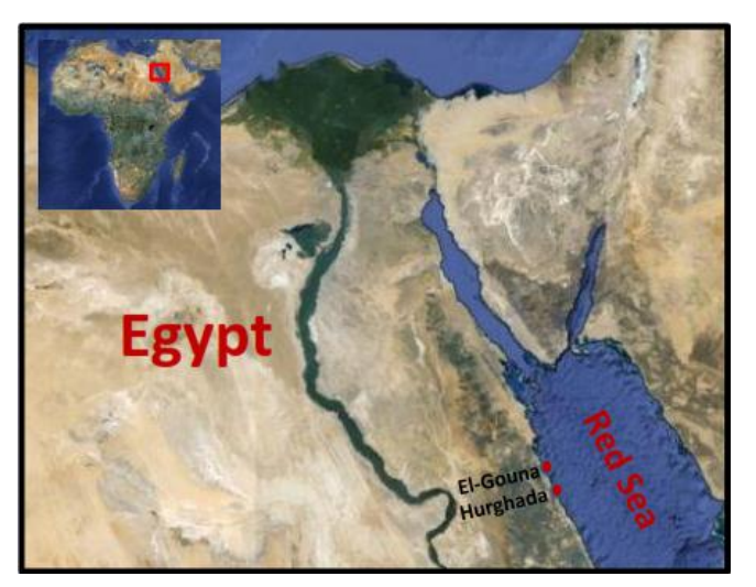
Fig. 2: Map of Egypt showing the two sampling sites on the Red Sea coast; El-Gouna and Hurghada.

Samples were cut from the sponge with a dive knife while wearing latex gloves and individual pieces were transferred to separate plastic sample collection bags, brought to the surface, maintained at ambient seawater temperature and transported to the laboratory in the same day of collection.