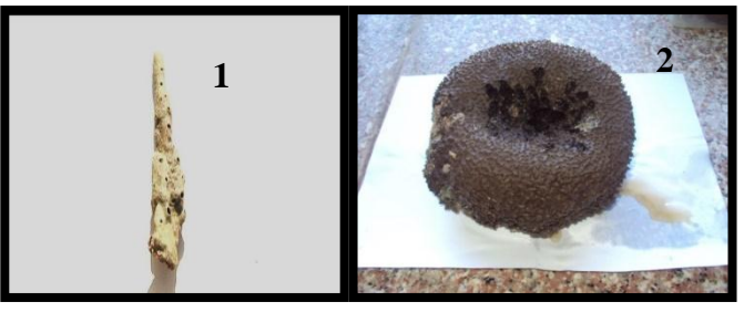
Fig. 1: Sponge samples 1 and 2

Two Sponge samples (Figure 1) were collected by SCUBA diving from the Egyptian Red Sea region. One of them was collected from El-Gouna region at depth 1.5 m (GPS: N: 27 22 39.98, E: 33 40 58.95) and the other one was collected from the National Institute of Oceanography and Fisheries station, Hurghada at depth 2m (GPS: N: 27 17 07.45, E: 33 46 26.50). (Figure 2).