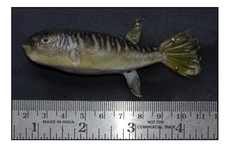
Fig. 2: Takifugu oblongus, 105 mm total length, caught from Tapi River, Gujarat

protruding upper jaw, beak like teeth on the both the jaws. Nostrils are plate-like with two openings. The pelvic fins are absent and caudal fin is truncated. Like most of the puffer fishes, small spinucles are present from nares to insertion of dorsal fin beginning from the lower jaw to the anus and also around the base of pectoral fin. Three darker transverse bands are present between pectoral fins and at dorsal fin base. White bands of irregular shape extend from lateral midline toward dorsum. The pectoral and caudal fins are yellowish in colour.