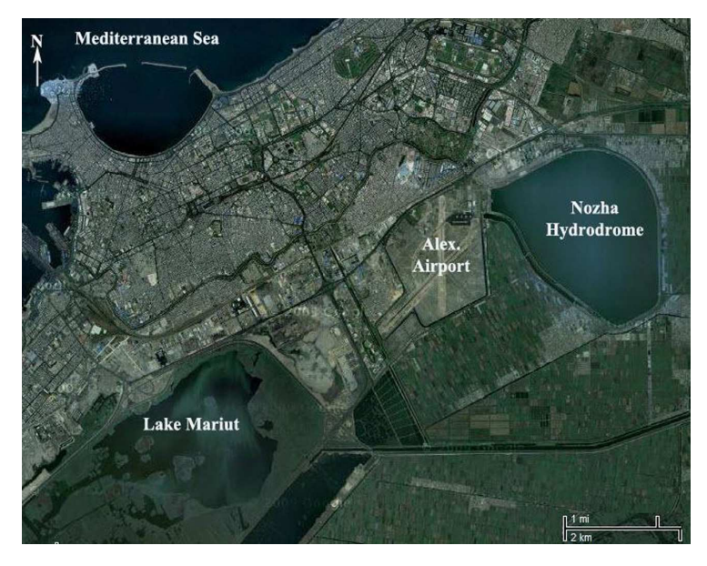
Fig. 1: Location of Nozha hydrodrome with respect to the Mediterranean Sea and Lake Mariut.

Nozha hydrodrome lies in the southern side of Alexandria city (latitude 31.193^{\circ} N, longitude 29.977^{\circ} E) and in the northeastern side of Lake Mariut (latitude 31.1^{\circ} E, longitude 30^{\circ} N) with a surface area of about 5.5 Km<sup>2</sup> and an average water depth 2.1m. It is a natural shallow freshwater wetland and it was used as fish culture with an average production of 200-250 t.y<sup>-1</sup> (Fig.1).