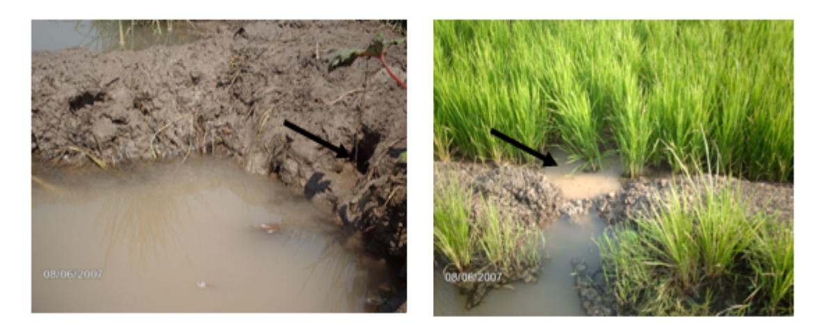
Photo 4: Damage of dykes and Rice crop in small irrigation channels at Fatmia Drain

Sharqya Governorate constructed pitching at Fatmia Drain to protect it from damages of crayfish burrows (Photo 5).