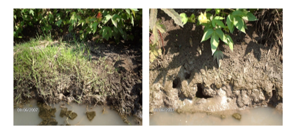
Photo 3: P. clarkii burrows densities at Fatmia Drain in Sharqya Governorate.