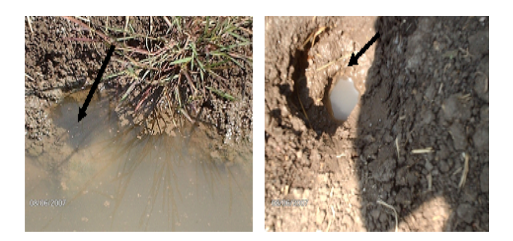
Photo 1: The chimneys of P. clarkii burrows; (a) irregular, (b) symmetrical at Fatmia Drain in Sharqya Governorate.