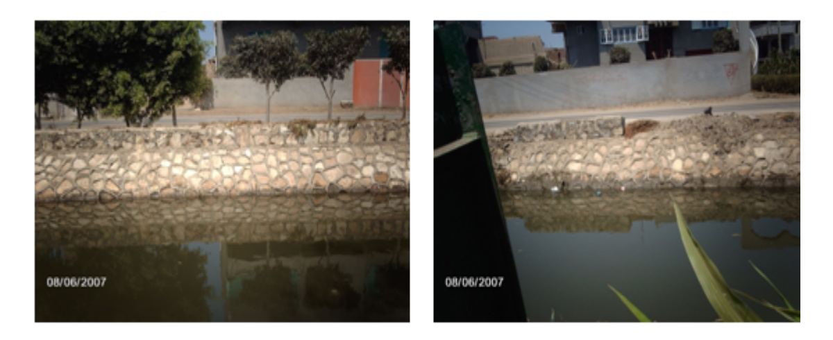
Photo 5: Pitching of damaged levees and dams of irrigation channels at Fatmia Drain

Sharqya Governorate constructed pitching at Fatmia Drain to protect it from damages of crayfish burrows (Photo 5).