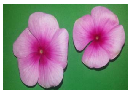
Control 0.75Gy A. Change in flower shape of Rosea