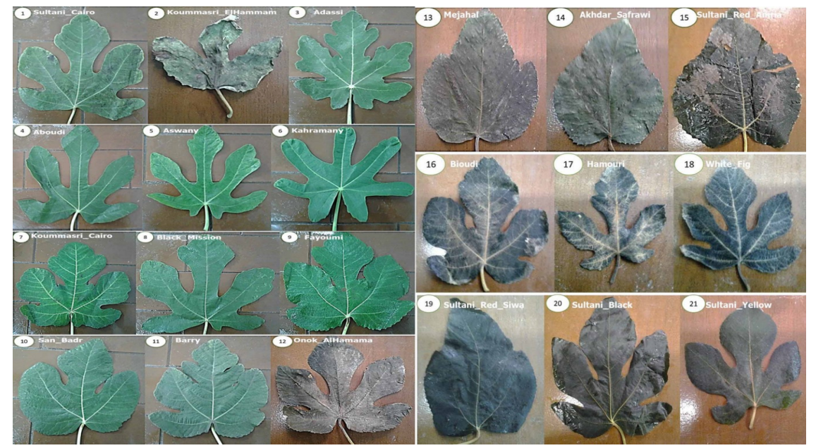
Figure 1. Morphological variations of fig accessions used in the current experiment

* Levels not connected by same letter are significantly different.