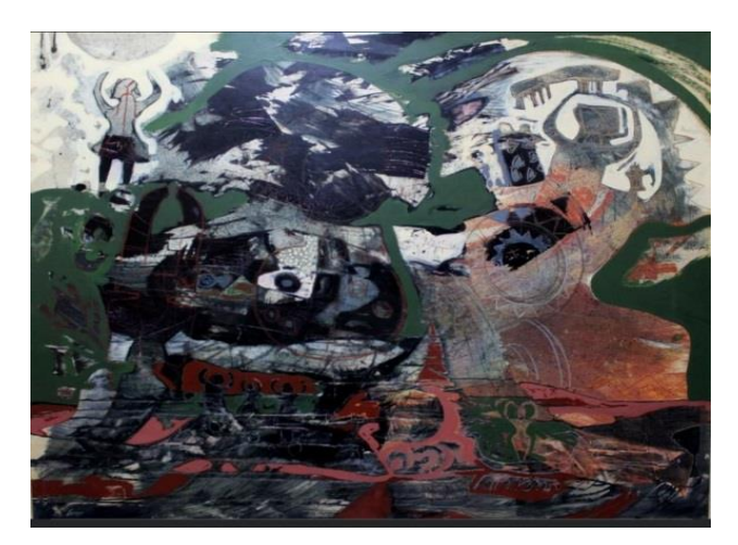
(figure, 4) the artist Amal Nasr primitive biography in 2019

Art is an imitation of the idea as Plotinus the philosopher saw, and the idea is the origin of everything that exists, and by approaching the essence of the idea during artistic expression, artistic beauty is achieved. It is realized in the artistic work that the happiness of the artist is realized as in the theory of (Catharsis) meaning purification according to Aristotle the philosopher, which sees that the role of beauty in art It performs a process of purification of emotions and feelings, which accumulate in us under pressure, so art transforms these emotions into an aesthetic goal and the purification process is completed. The idea from which the painting was formed