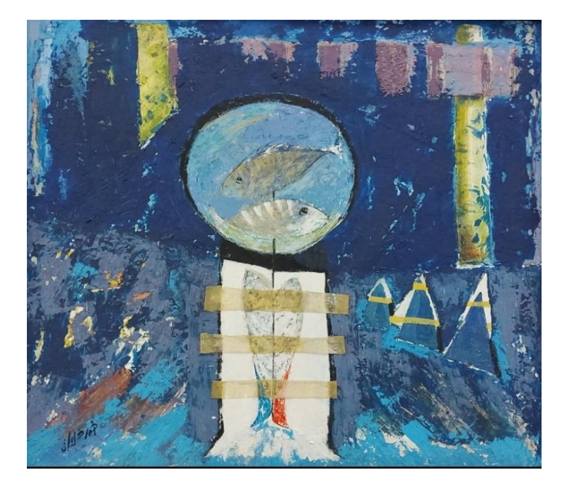
(figure 2) the feast in 2000 by the artist Ahmed Khalil Muhammad

Monads include a realization of the essence of the universe, from which it is possible to form a preliminary idea of a work of art, which appears in the plastic relations, content, symbols and emotions, which are all psychological and moral factors, clarifying the initial idea of the concept and meaning of the artwork, controlled by the inner will of the essence of a vision The artist, and an example of this is the painting of the feast in 2000 by the artist Ahmed Khalil Muhammad (figure 2 ), And in which he achieved a preliminary image of shapes and elements without paying attention to details and perspective, but it is flat and abstract with chromatic techniques and treatments in its initial image that helped clarify the idea for him. , a circle appeared in the middle of the top of the painting with two fish, and he treated the rest of the space with some colored rectangular areas and some geometric symbols.