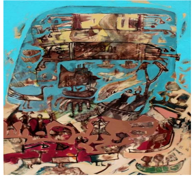
(figure 3,) the artist Amal Nasr primitive biography in 2019